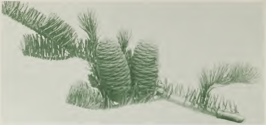
White (or concolor) fir. (About one-half natural size)